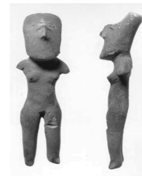
Figurine from the 1970s excavations.

Two tours of each area (four in total), beginning at 2:00 and held every hour, will be given. Groups will be limited to 15 to 20 participants. On tour, by Linda Gregonis, will feature the location