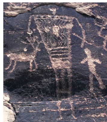
Basketmaker glyph at Rock Art Ranch

Rock Art Ranch is a private ranch 25 miles southeast of Winslow that still raises cattle and bison. The ranch contains some of the Southwest's most spectacular rock art, with more than 3,000