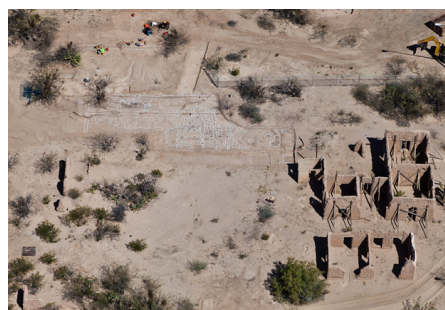
The remnants of Officers' Quarters 1 and 2, prior to stabilization work.