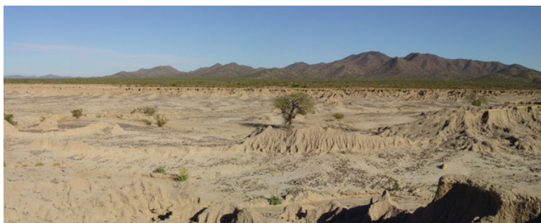
Panorama of La Playa

Next General Meeting: April 17, 2017; 7:30 p.m. University Medical Center www.az-arch-and-hist.org