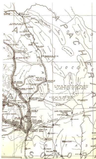
Portion of Hurbert Eugene Bolton's "Map of Pimeria Alta, 1687-1711."

Clearly, there is little relationship between native O'odham place names and the streets of Tucson beyond the superficial, but I will say that here in Tucson, especially in older neighborhoods, we have the benefit of having at our fingertips the ability to look up the history of why a street is called something or another because it is recent history that is written down by the modern inhabitants. In the case of many towns and places in southern Arizona, it takes a lot more research — and indigenous knowledge based on oral traditions and histories — to understand the deeper meaning and cultural connection to them. Suffice it to say, as I drive through southern Arizona in the future, I'm going to continue to look at maps and think about where the names of these places originated in time and culture and how they have evolved and transformed through time.