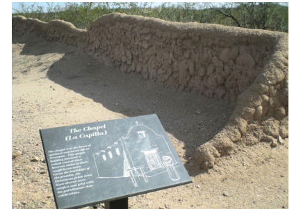
Ruins of Terranate