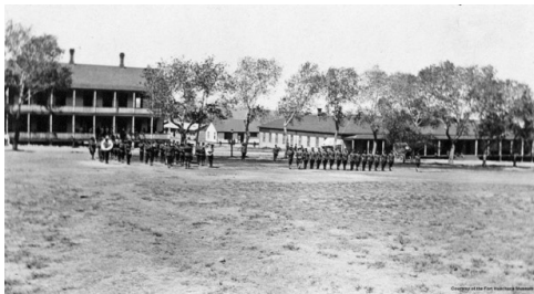
10th Calvary at Fort Huachuca, circa 1910s