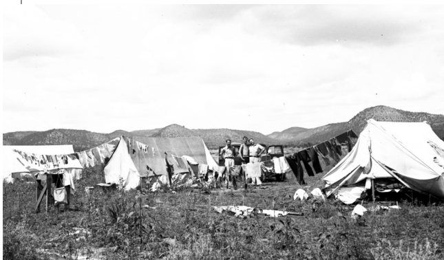
Field camp at Kinishba Pueblo, 1935.

Point of Pines, El Coronado, Grasshopper, Silver Creek, Marana Mound, Tumamoc Hill, University Indian Ruins, Rock Art Ranch, and Mission Guevavi. Many of these alumni were UA students (about 47 percent).