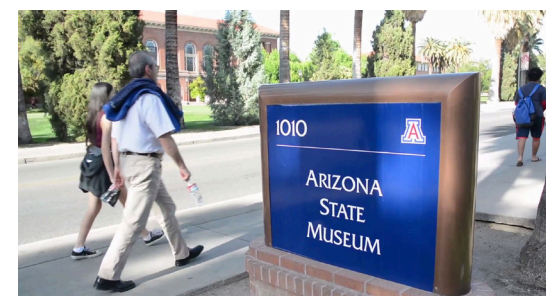
The Arizona State Museum at the University of Arizona has spent decades sifting its collection of Native American remains and artifacts to determine what should be returned to tribes.

"In the scientific profession, you tend to view bone as just that,