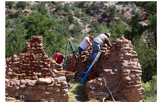
Stabilization efforts at the Jemez Historic site.