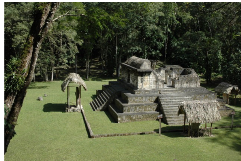
Structure A-3 in the South Plaza of Ceibal, Guatemala.