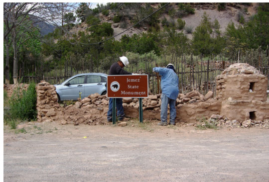
Demolishing the entrance to the Jemez Historic site.

It is a long and laborious process. Much of the stabilization work is conducted by first removing vegetation from the treatment area. Next, the deteriorating stucco façade is chipped-away to reveal the underlying original stone and adobe walls. To these exposed walls,