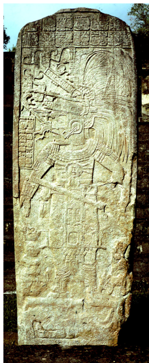
Stela 11 at Ceibal, Guatemala.

Since archaeologists from Harvard University explored it in the 1960s, the site of Ceibal in the southwestern Petén region of Guatemala has been important in the study of Maya origins. That research has shown that Ceibal was one of the earliest inhabited sites in the Maya lowlands. Its occupation started around 1000 B.C. at the beginning of the Middle Preclassic. Questions remained about how extensive this early settlement was and how it was organized. How did this city begin? Was it a planned community or did it grow slowly and haphazardly?