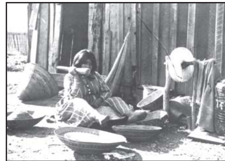
Pomo woman using assortment of baskets to prepare acorn, 1893. [Photo from California, in Woven Worlds: Basketry from the Clark Field Collection at the Philbrook Museum of Art; SI-NAA Neg. 47750A]