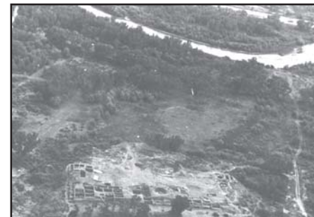
Aerial photograph showing Salmon's close location relative to the San Juan River.

Next General Meeting: September 17, 2007