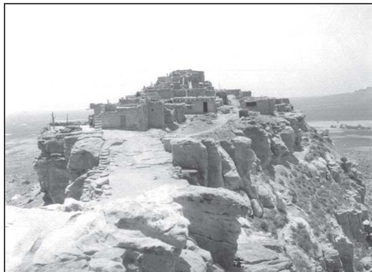
Walpi village on First Mesa, 1927.