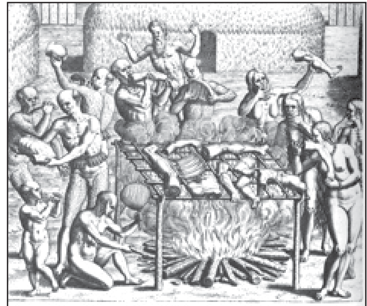
Cannibalism in Brazil in 1557, as alleged by Hans Staden.