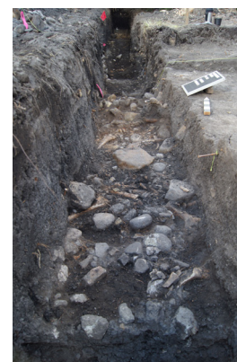
AAHS and Coronado Forest archaeologists excavating the bone bed at Desperation Ranch.

Holiday Party & Research Slam: December 15, 2014 6:00 p.m., "Petroglyphs"; 228 S. Park Ave. www.az-arch-and-hist.org