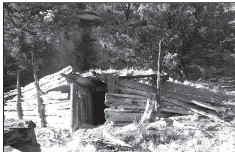
An elaborate dugout at the Sue Savage Homestead in Cebolla Creek, El Malpais National Conservation Area

Next General Meeting: January 17, 2011 www.az-arch-and-hist.org