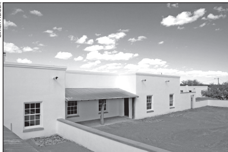
Pima County Historic Preservation Bonds. Canoa Ranch: Rehabilitated blacksmith shop, tack room, and salt storage building.

Next General Meeting: July 19, 2010 < www.az-arch-and-hist.org >