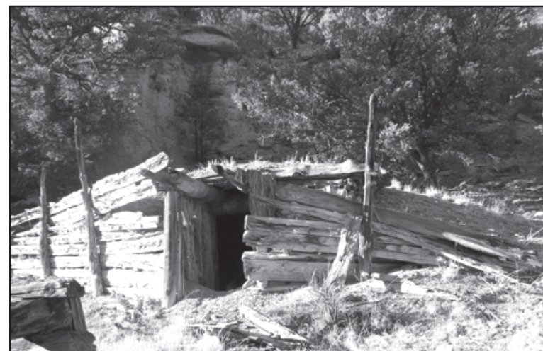
An elaborate dugout at the Sue Savage Homestead in Cebolla Creek, El Malpais National Conservation Area.

Next General Meeting: July 18, 2011 7:30 p.m., Duval Auditorium, University Medical Center www.az-arch-and-hist.org