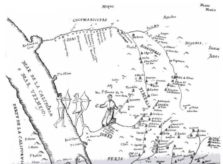
Original Kino map from Bolton's Rim of Christendom.