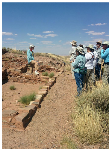
Field trip to Homolovi State Park.