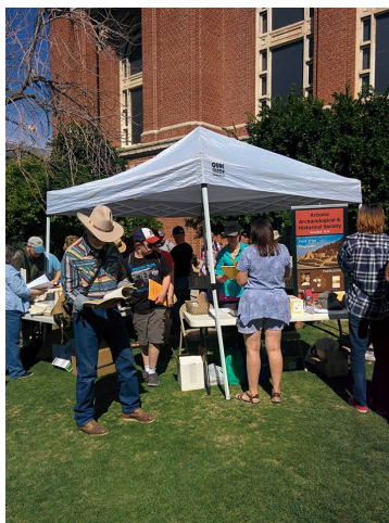
AAHS book sale at ASM; all to support the ASM library.

The Field Trip Committee has taken members on 13 field trips across Arizona this past year to see amazing archaeological and historical resources. Highlights include Homolov'i and Rock Art Ranch, Ventana Cave, and the Petrified National Monument. I just