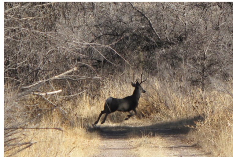
A mule deer in the eastern Mimbres area, southwestern New Mexico (photo by Steve Northup).