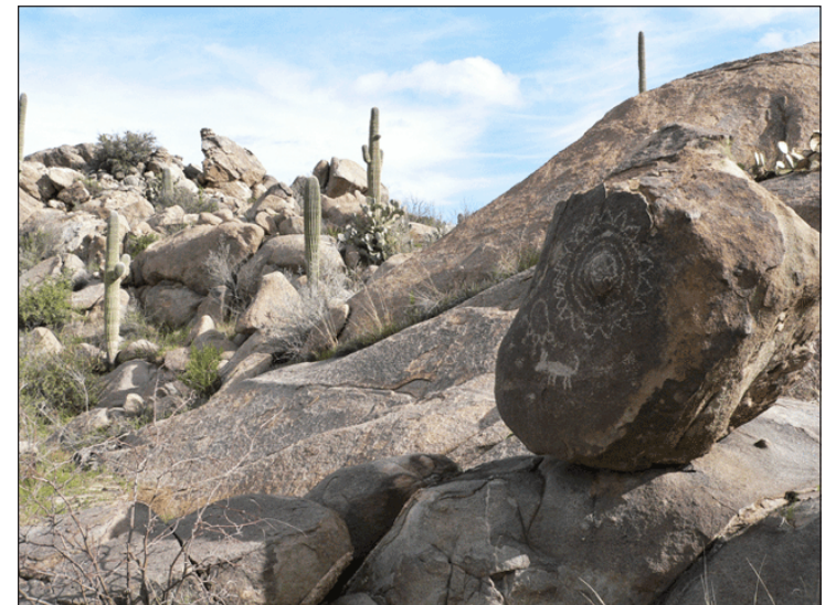
Prominent solar marker glyph at Sutherland Wash, which may also be a representation of a flower.

Next General Meeting: May 20, 2013 7:30 p.m., Duval Auditorium, University Medical Center www.az-arch-and-hist.org