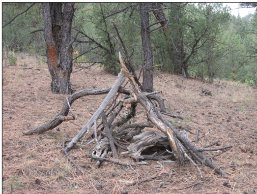
Top: Native American rockshelter above Seeley Canyon. Bottom: Possible wickiup and culturally modified tree.