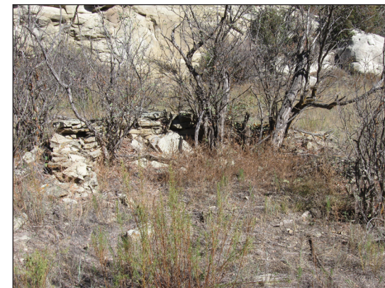
Nineteenth century residential structure (photograph by Office of Archaeological Studies staff).

In addition, OAS archaeologists discovered several Native American sites, including a wickiup possibly occupied by Apache peoples in the early nineteenth century, and a rockshelter used by an unknown prehistoric group. These sites help us understand land use by Native American people. By identifying these sites, archaeologists can direct labor crews away from these areas during the reclamation process.