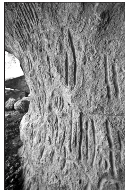
Deeply incised and ground designs in a southeastern Arizona rockshelter, marking what may be one of the earliest styles of rock art depiction in North America

Next General Meeting: November 15, 2010 www.az-arch-and-hist.org