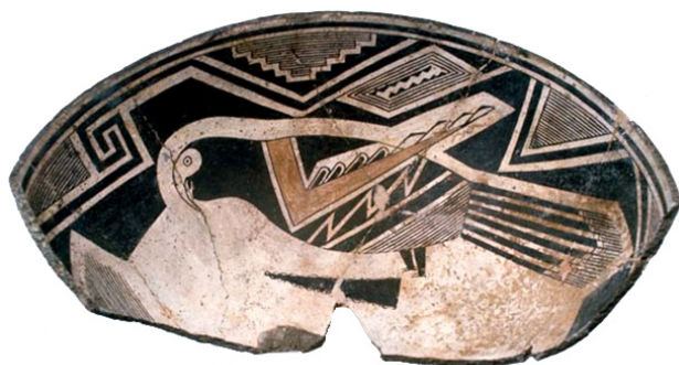
Partial Mimbres Classic Black-on-white bowl with a scarlet macaw, identifiable by the white area around the eye (from the National Museum of Natural History, Smithsonian Institution).