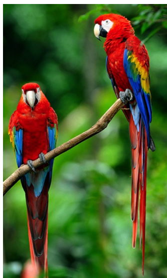
Scarlet macaws; note the long (red) tail feathers.