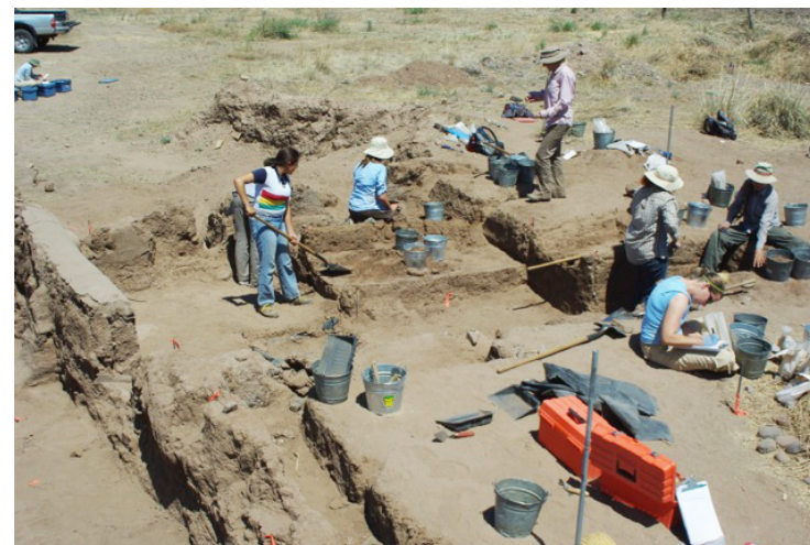
The first cultivated chile in an archaeological context was found a few kilometers from Paquimé-Casas Grandes, just south of the U.S. border in northern Chihuahua.