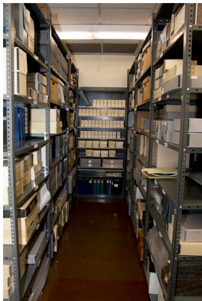
One of five areas currently holding the photo collections (photograph by Jannelle Weakly).

ASM's photographic collection is highly valued — one of the important and irreplaceable components of the museum's extensive