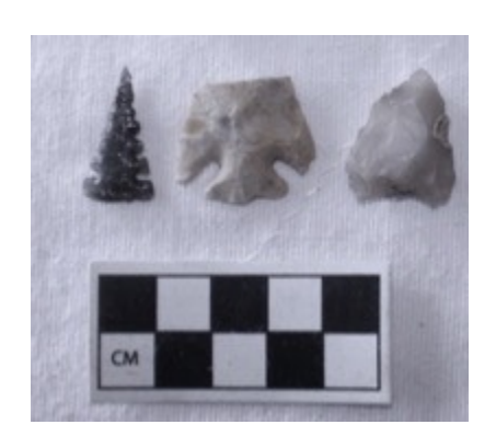
Fig 5. Projectile Points from Rusty's Ruin

Amongst the DeFausell material were artifacts and field notes labeled with the name "Rusty's Ruin." According to site maps and notes, Rusty's Ruin is on the same property as the DeFausell site, and is in fact labeled with the same LA number (LA 34779). It seems that Rusty's Ruin may have simply been a roomblock that was part of the DeFausell site, but I'm not entirely sure. While there is a thick file folder with field notes from Rusty's Ruin, only a few artifacts from Rusty's Ruin were in the collections (one mixed bag of artifacts, one diagnostic sherd, a palette, and a few projectile points). Encouragingly though, multiple bags of botanical material were found in the collections—hopefully these can be used to obtain dates for the site.