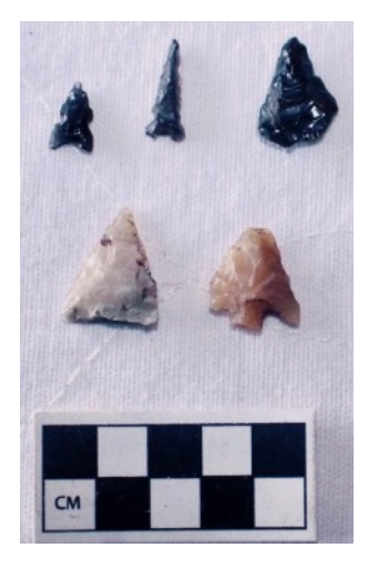
Figure 4. Projectile points from DeFausell