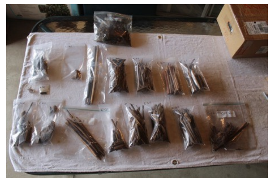
Figure 8. Material from "cave sites" currently in Fife Lake