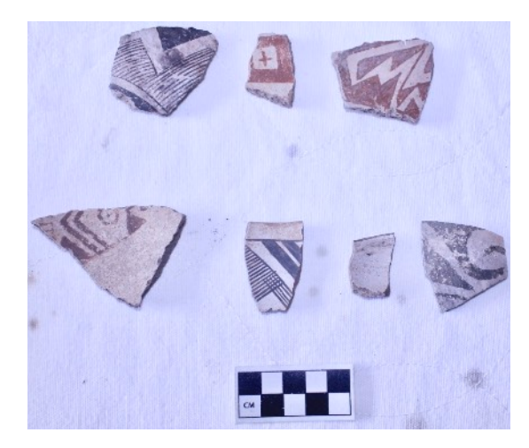
Figure 3. Diagnostic sherds from DeFausell