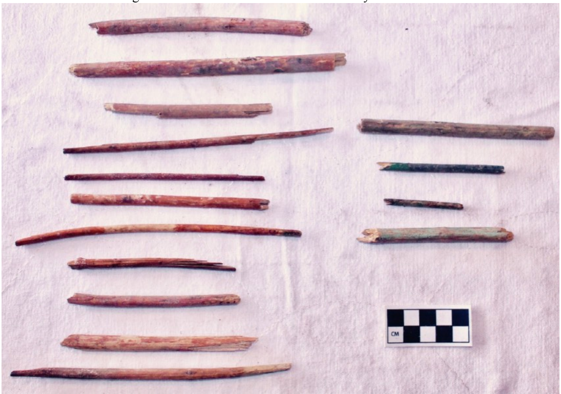
Figure 9. Painted sticks/reeds from "cave sites"