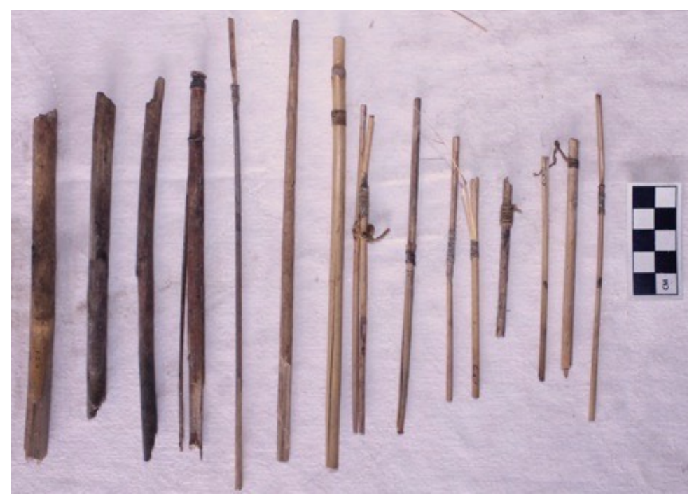
Figure 10. Reeds/arrows with binding from "cave sites"