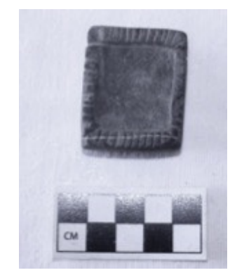
Fig 7. Palette from Rusty's Ruin