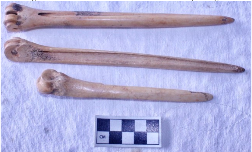
Figure 2. Bone Awls from DeFausell site