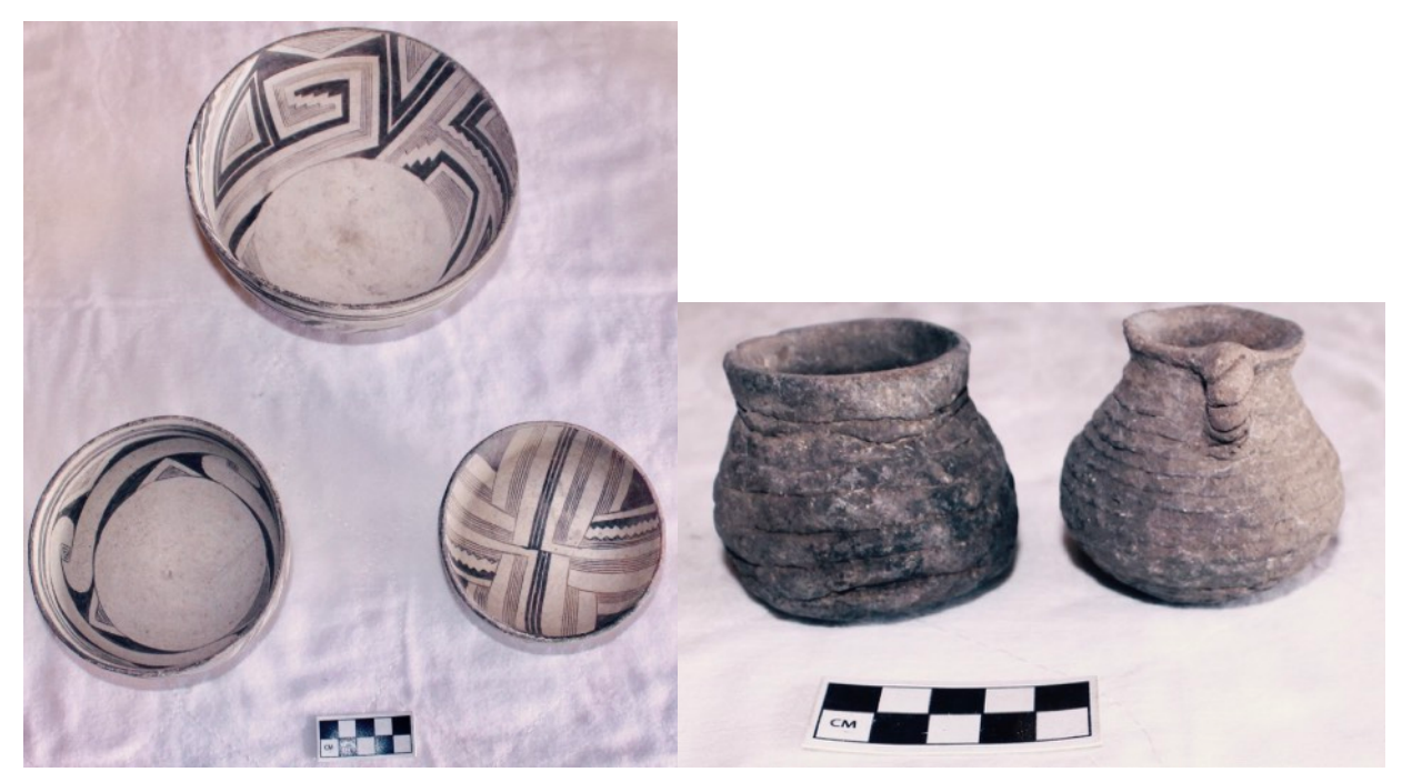
Figure 11. Bowls from Villareal I

The only material from Villareal I were a set of complete bowls, small corrugated jars, a stone axe head, and a site map.