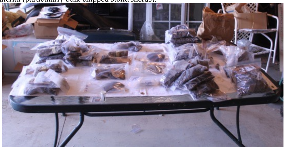
Figure 1. Artifacts from DeFausell site in Fife Lake, Michigan

Based on the excavation notes and field maps in Fife Lake, it seems like there should be more material from the DeFausell excavations. However, it was not in Fife Lake, and I currently am unsure where these artifacts ended up. I plan to research where this material might be, and if it is curated in a research institution—if so, the DeFausell material in Fife Lake should be curated with that material. Pat mentioned to me that the property owners did keep some of the artifacts collected during excavation, particularly a bone awl with the proximal end carved into the shape of a ram's head, but I did not get the impression that the property owners kept a lot of the material (particularly bulk chipped stone/sherds).