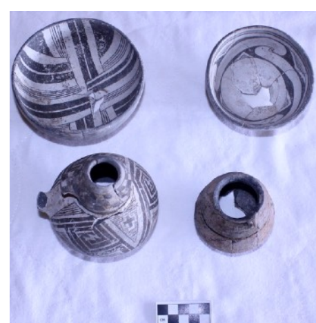
Figure 15. Unprovenienced ceramics vessels