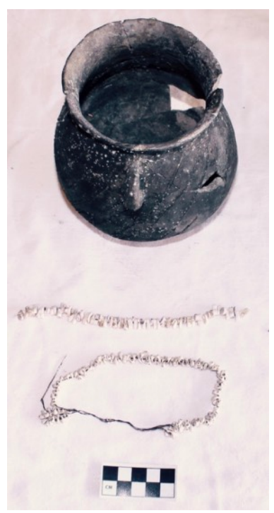
Figure 13. Unprovenienced jar that contained shell beads