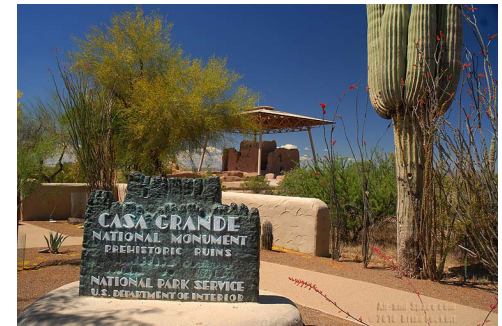
Casa Grande Ruin, then and now