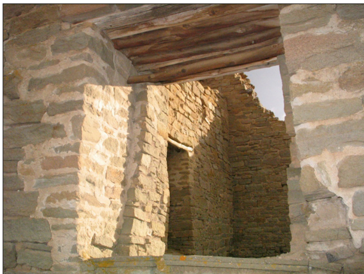
Juniper door lintels at Aztec Ruins in northwestern New Mexico.

Next General Meeting: September 17, 2018; 7:30 p.m. Duval Auditorium Banner-University Medical Center 1501 N. Campbell Ave. Tucson, Arizona www.az-arch-and-hist.org