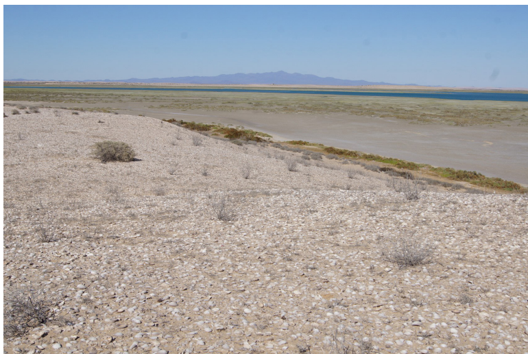
Coastal shell middens along the northern Gulf of California

Next General Meeting: February 18, 2019; 7:30 p.m. Duval Auditorium Banner-University Medical Center 1501 N. Campbell Ave. Tucson, Arizona www.az-arch-and-hist.org