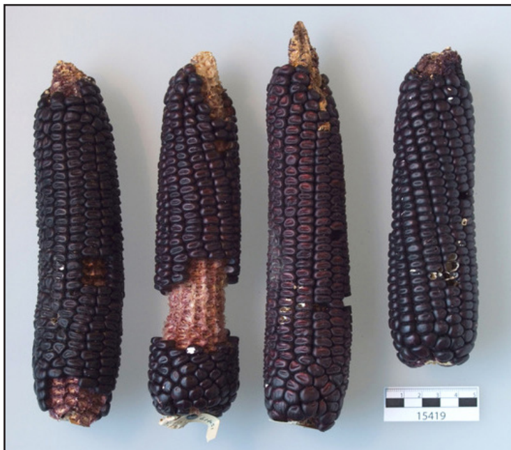
Blue corn from the University of Michigan Museum of Anthropological Archaeology collections.

Next General Meeting: April 19, 2021 7:00 pm