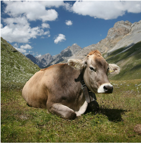
Domestic Swiss Braunvieh cow, Engadin, Switzerland.

consumption/reduce waste water, recycle, plant trees, compost, and become active in local politics or volunteer your time to help clean up the environment in your community (Denchak 2017). Most of these actions can be adjusted in our daily routines, can save you money, and can help relieve the burden on our precious environment.