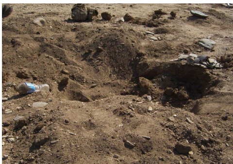
Pothole vandalism in the Tucson Region discovered and reported by Fran.

Being an outdoor person who also enjoys learning, research, and data collection, it was easy to dive into site steward activities. Carl and I attended lectures sponsored by AAHS, Archaeology Southwest, and Old Pueblo Archaeology to learn more about the ancient people of the Southwest. We went out frequently to monitor sites, many of which required long beautiful hikes through the desert. I was comfortable writing vandalism reports and noting changes in the condition of sites over time. I soon found myself co-presenting the full day of classroom training to new stewards, coordinating sites in the Southeast area of the Tucson region, and mentoring new stewards.