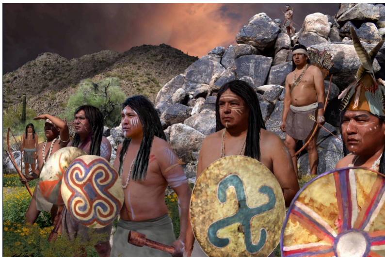
Ancestral O'odham war party with members of the modern O'odham community.