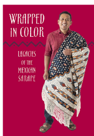
EXHIBIT CELEBRATION Wrapped in Color: Legacies of the Mexican Sarape

Saturday, October 23, 2021 10:00 a.m. - 2:00 p.m.