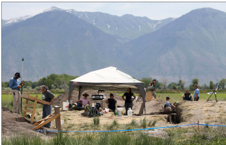
Hinckley Mounds site excavation

Next General Meeting: July 17, 2023 7:00 pm (MST) AAHS@Home (Zoom webinar) www.az-arch-and-hist.org